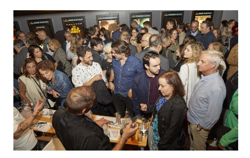
their fiOpening night reception hosted by Axia Spirit.